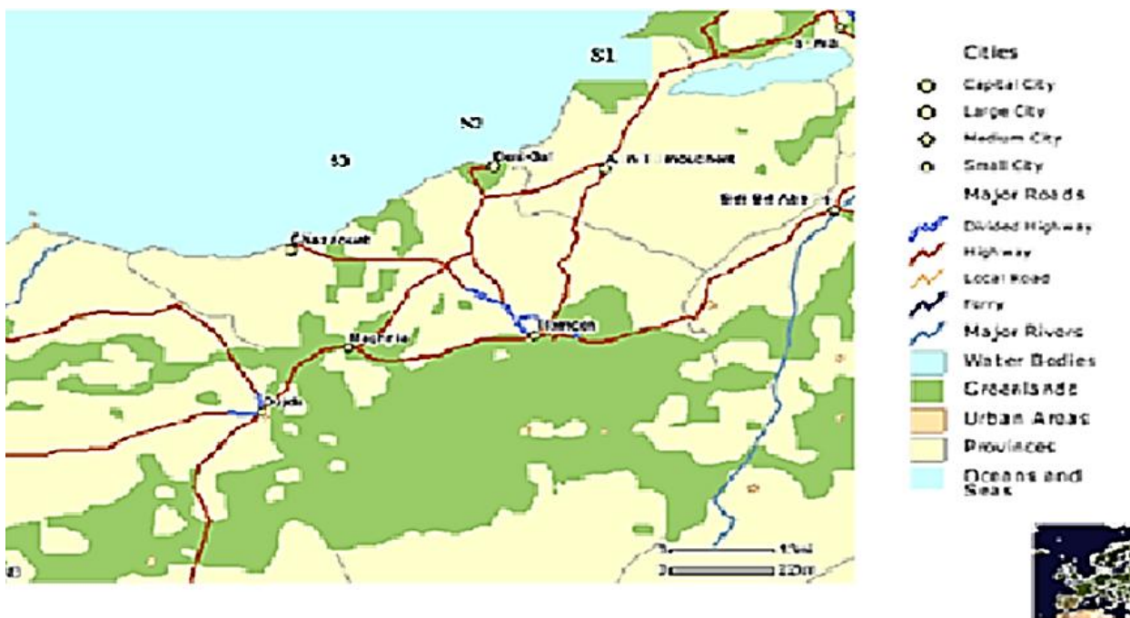
Figure 1 Map of Geographical Situation