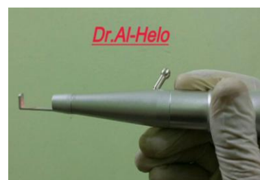
Figure 2 The pharyngeal hand piece with a backstop

A special pharyngeal hand piece with a backstop (fig2) was used to incise the soft palate.