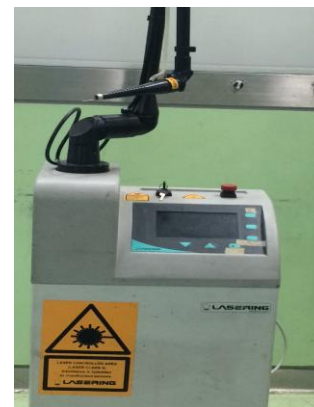
Figure 1 CO2 laser system that used in this study

LAUP performed under local anesthesia which, in sitting position, topical anesthesia is used (10% xylocaine) which is sprayed in the posterior oral cavity. Then an injection of lidocaine 1% with 1:100,000 epinephrine. The patient wore a protective eye glasses, Surgical use of the carbon dioxide laser (fig 1) was commenced after waiting 10 minutes for the anesthesia to take its effect.