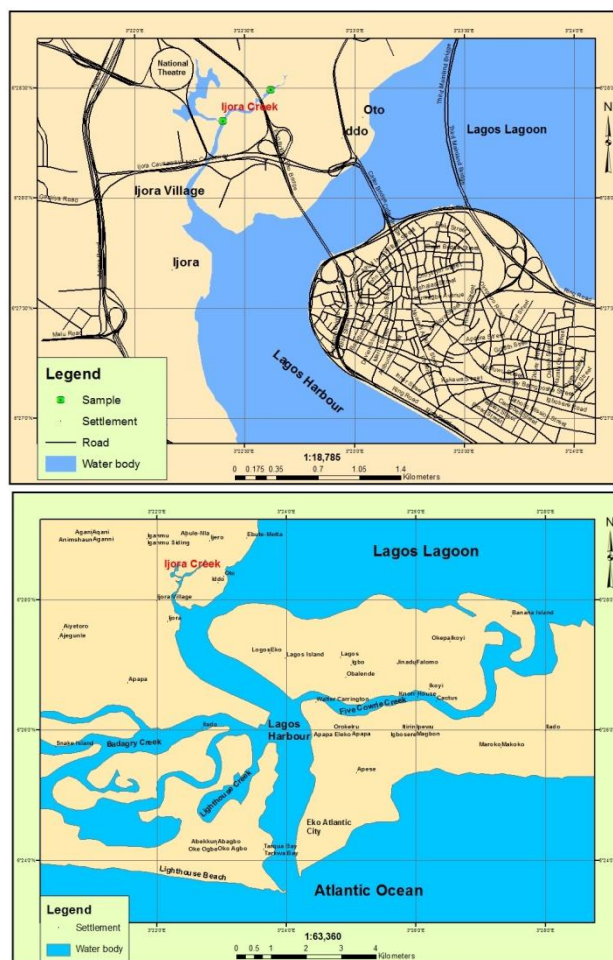
Fig. 1: Part of Lagos showing Ijora creek and the sampling site

Furthermore, during the rainy season, especially when the rainfall of high intensity for a longer duration, larger volume of water enter the Creek carrying all kinds of toxic chemicals, oils and grease, heavy metals from motor vehicles, animal wastes and sewage. The pollution is significant in the Creek where large areas of paved surface result in increase run-off from roads, industrial sites and residential areas. The Creek has a characteristic main feature of being linked to the Lagos harbour. At high tide water from the Atlantic Ocean flows through the canal into the Creek. The high tides that alternates with the low tides makes the Creek to be very dynamic in nature. However, the Creek is not navigable at both High and Low tide periods. According to Onyema (2007), the flora at the creek include, Paspalum vaginatum , Paspalum orbiculare , Phloxerus vermicularis , Typha sp., Marisus alteriflorus , Rhynchospora sp. and few white ( Avecennia nitida ) and red mangroves ( Rhizophora racemosa ). The fauna of the creek include Periphthalmus Balanus pallidus , Chthamalus and Gryphea gasar (Onyema, 2007).