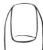
Fig.2 A Vertical Rectangle