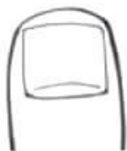
Fig.2 G Square