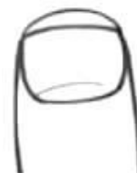
Fig.2 B Horizontal Rectangle