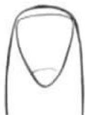
Fig2 F Inverted Triangle