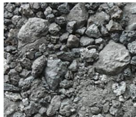
Figure 1: Blast Furnace Slag

furnace type. In ore feed shaving 60% to 65% iron, slag production in blast furnace varies from 300 kg to 540 kg per 1000 kg of crude iron production. Ores of lower grade produce higher slag, sometimes high as in one tone of slag produced per ton of pig iron.