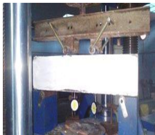
Figure 4: Experimental test set up of flexural loading

It is essential to estimate Flexural strength of the load on which the concrete member cracked. The size of specimen cast for this test was 700 ×150× 150mm as shown in figure. Universal testing machine (UTM) of capacity 100 tones was used to obtain the flexural strength of beams. For the test two-point system of loading was adopted. The specimens were tested after 28 days of casting. The experimental set up of beams is shown in Figure 4.