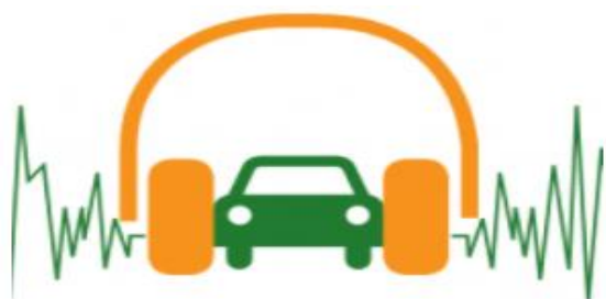
Figure 2: Transport noise

Noise levels in most residential areas in metropolitan cities are hovering around the border line due to increased vehicular noise pollution. In general, on urban roads there are distinct traffic peaks in the morning and evening as people travel to and from work.