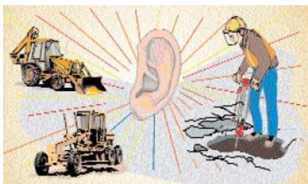
Figure 3: Occupational and industrial noise

Occupational /Industrial Noise: It is the sound having high intensity, mainly caused by industrial machines. Sources of such noise pollution are various factories' machines, industries, and mills. Noise from mechanical saws and pneumatic drills is unbearable and a nuisance to the public. It also includes noise from domestic gadgets e.g. washing machines, vacuum cleaner etc. Industrial workers who are exposed to noise for 8 hours per day and 6 days per week suffer from occupational noise pollution.