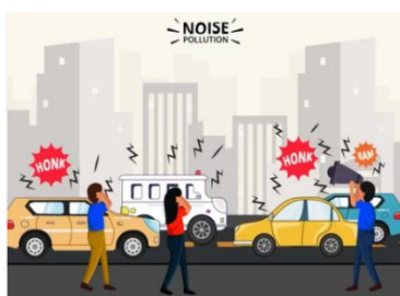
Figure 1.0: Noise pollution scenario in common life

Some of the loudest underwater noise comes from naval sonar devices. Sonar, like echolocation, works by sending pulses of sound down into the depths of the ocean to bounce off an object and return an echo to the ship, which indicates a location for object. Sonar sounds can be as loud as 235 decibels and travel hundreds of miles under water, interfering with whales' ability to use echolocation. Research has shown that sonar can cause mass strandings of whales on beaches and alter the feeding behavior of endangered blue whales ( Balaenoptera musculus ). Environmental groups are urging the U.S. Navy to stop or reduce using sonar for military training.