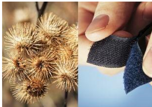
Figure 1: Velcro's hook and loop

organisms and ecosystems managed to solved it, and the second direction is done through the translation of a specific trait in an organism to a design that is responsive to human issues (Taneli, 2013).